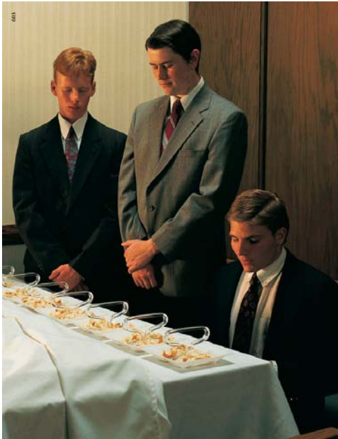
Gospel Art Picture Kit # 603 Blessing the Sacrament

The sacrament is blessed by those having priesthood authority. A priest or elder breaks the bread into pieces and then blesses it. The sacrament is then passed to the congregation by a deacon or other priesthood holder. Then the water is blessed and passed. Jesus revealed the exact words to be used for both sacrament prayers. We should listen carefully to the prayers and think of Jesus Christ as we partake of the sacrament.